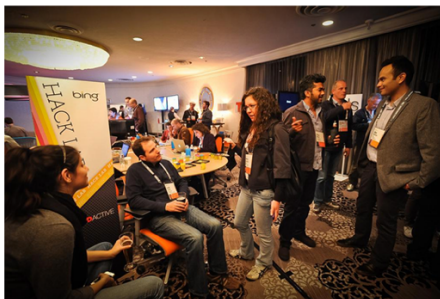
Health App Hackathon by Microsoft