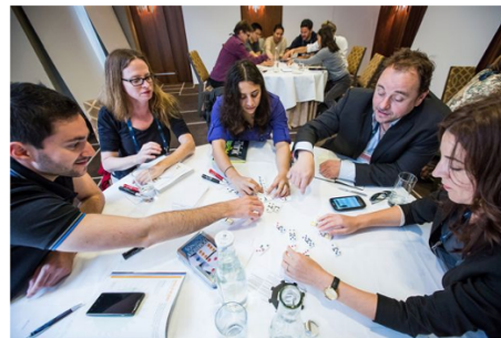
Workshop on tackling difficult problems by Autodesk