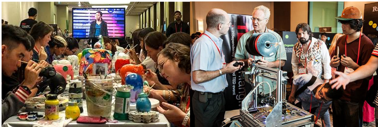
Art sculpture painting + livestreaming

Below are a few examples of add-on activities we encourage from our sponsors that demonstrate that you are a Thought Leader , a Socially Responsible Company , or a Generous Supporter :