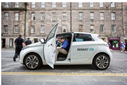
Renault test-drive 100% electric car