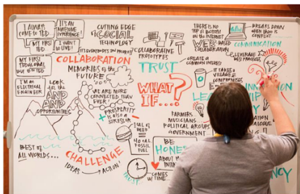
Idea boards around the event venue, may be occupied by a sponsor's staff to help facilitate brainstorming.