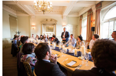
Deep-dives during lunch run by an expert from the sponsor