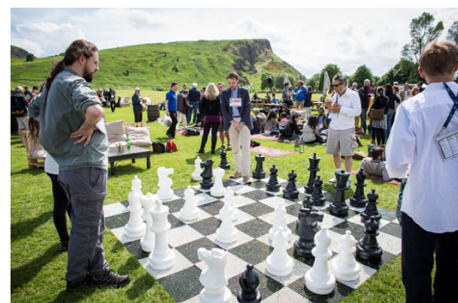
Sponsoring leisure toys and tools