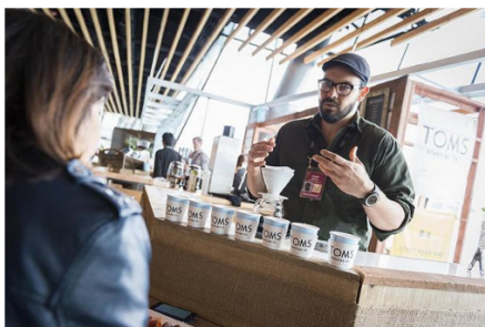
Sponsoring a resting lounge