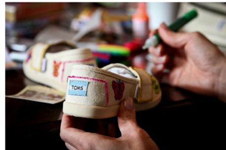
Shoes giveaway by TOMS